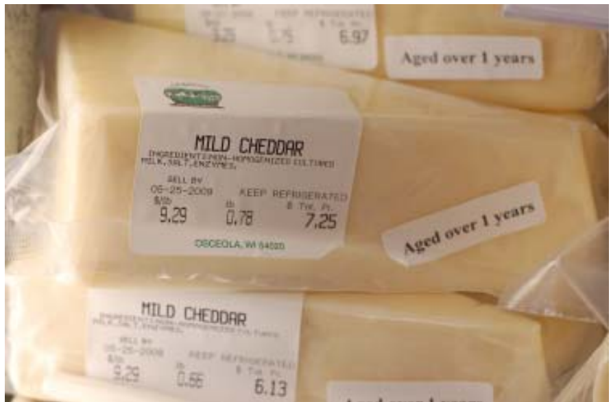
One of our first major supporters, Crystal Ball Farms, continues to supply our customers with a great majority of our milk, butter and cheese.

While some of the products we sell in bulk are not local, we pride ourselves on advancing local food and partnering with suppliers that share our goals and vision. Popcorn, oats, grains and many of our beans are from local and regional producers. Other products are sourced through fair-trade suppliers or farms engaged in value added processing and distribution. We've found that sourcing non-local products through local suppliers results in higher quality and lower overall costs, as transportation and logistics are consolidated.