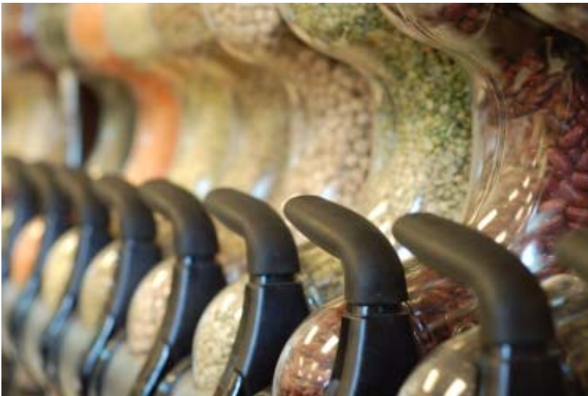
Sales of Class C Shares in 2008 made the new set of bulk bins, pictured above, possible. Thanks to our many community investors!

Tortilla Chips from Whole Grain Milling Company of Welcome, Minnesota. Sales of local honey, maple syrup, sorghum, jellies and jams continue to grow. With the move, more shelf space became available and we continue to fill the empty spots with two goals: meet the needs of our customers and provide grocery store access to small farmers and food producers.