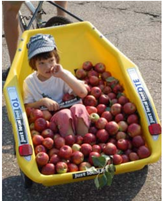
Just Local Food apple cart in the International Fall Festival parade. One example of our many contributions to our community.